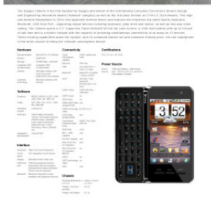
Former Verizon Website