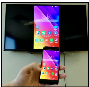
Wireless HD Beaming