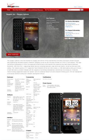
Former Verizon Website