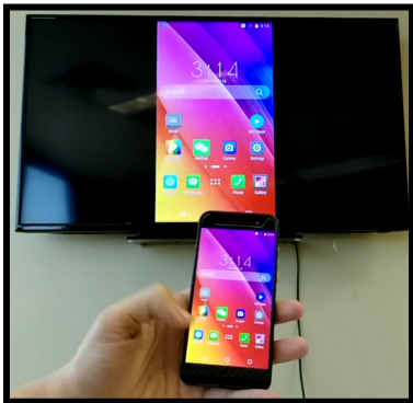
Wireless HD Beaming